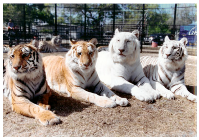
These are four different kinds of tigers. The Bengal tiger is the one on the left. http://www.marcantigers.org/MTP4colors.html