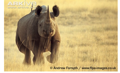
http://cdn l.arkive.org/media/3B/3B | 9CBB8-8 | 5C-4486-B CC9-45FA808E | 78F/Presentation.Medium/Southwestern-blac k-rhinoceros-male-charging.jpg