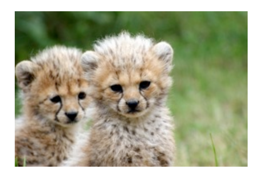
Two cheetah cubs (above). A cheetah family (below).

The cheetah lives in Africa and Asia. They also can be found in India and Iran. They need to live under trees and tall grass to escape from the heat. Cheetahs need open spaces to chase their prey. Their prey include rabbits, antelope, some birds, gazelles, wildebeast calves, impalas, and smaller hoofed animals. Therefore, if the cheetahs weren't fast enough, they wouldn't catch their prey. As you can imagine, if cheetahs didn't have these kinds of foods, they would become more extinct.