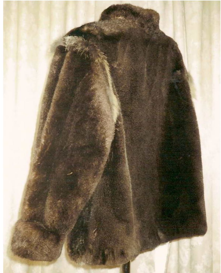
A coat made from otter fur

Sadly, these little critters are being threatened almost to extinction. Otters are being killed by polluted water and fish that have been poisoned by pollution. The great oil spill in the Gulf of Mexico in 1989, killed a lot of sea otters. Otter pups can be eaten by owls, foxes, and alligators. Stop what can be stopped. A lot of people are buying and selling these animals. Sea otters are hunted for their fur. Otter fur is warm and water proof, so people use it for coats. Trappers will catch and kill as many otters as they need to make a coat sometimes more. It takes a lot of otters to make one coat, that's a lot of killing.