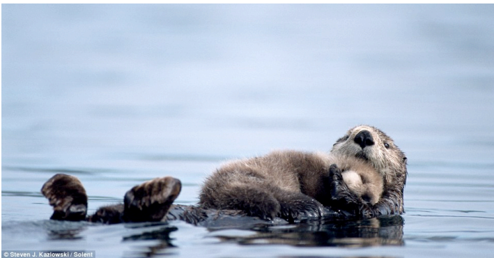
Mother otter and her young

Baby otters, also known as pups, are very playful. Baby otters are in their mother for nine weeks before birth. The otter pups are born with their eyes closed, but after one month their eyes will open. Pups stay close to their mother for warmth, because their fur is thin and doesn't give much warmth. These little pups are very fun and frisky.