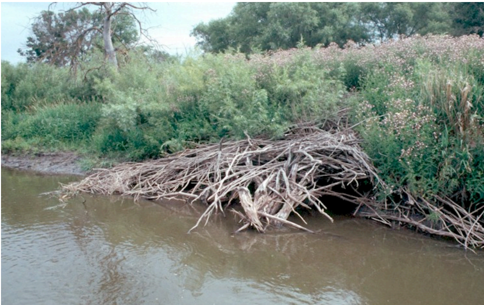
Old beaver den

Otters have homes just like us. A river otter will sometimes use an old beaver den as a home to raise her young. Sea otters often sleep together in groups called rafts. Sea otters will eat clams, sea urchins, fish, and eels. The river otter will eat mice, fish, and if they're lucky they'll grab an eel, their favorite snack. Otters will eat the whole fish, even the bones, using their sharp teeth. Clearly otters have a wide variety of food and shelter.