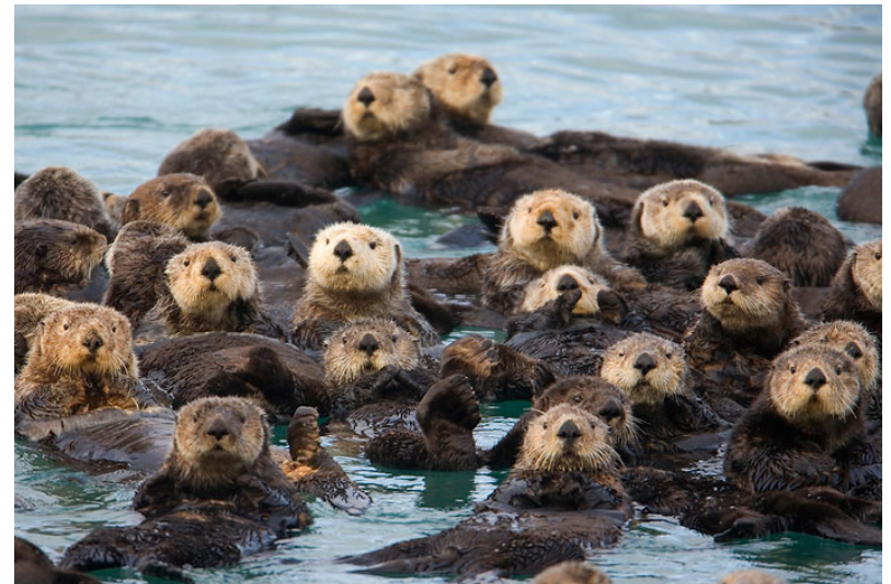
Raft of Sea Otters

http://newyorkoutdoors.files.wordpress.com/2007/11/beaver_lodge1.jpg