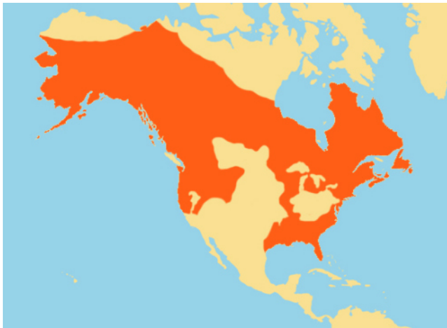
Range of the river otter in north america

Ever wonder where in the world the otters live? Sea otters live on the coasts of Asia and North America. They also live in the Pacific Ocean. River otters are more spread out than sea otters. River otters live on five of the seven continent. They don't live in Australia or Antarctica.