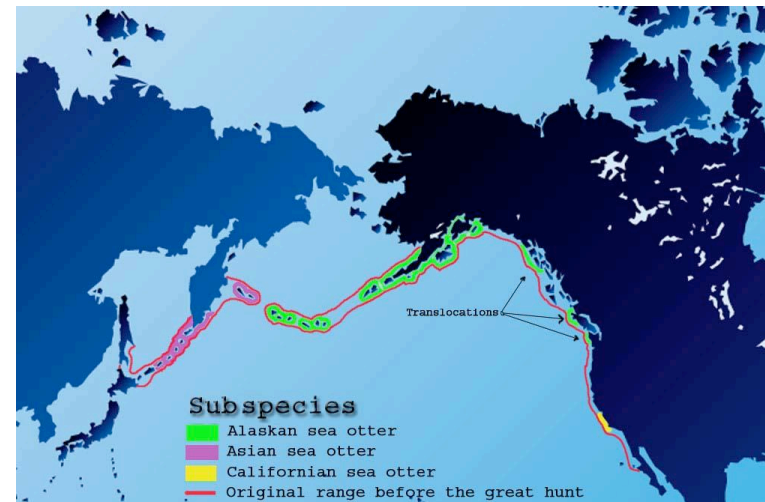
Range of the Sea otter

http://atowhee.files.wordpress.com/2011/11/rangemap_river_otter_550x400.jpg?w=500&h=363